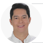
Pedro Flórez Senate, Colombia Senator